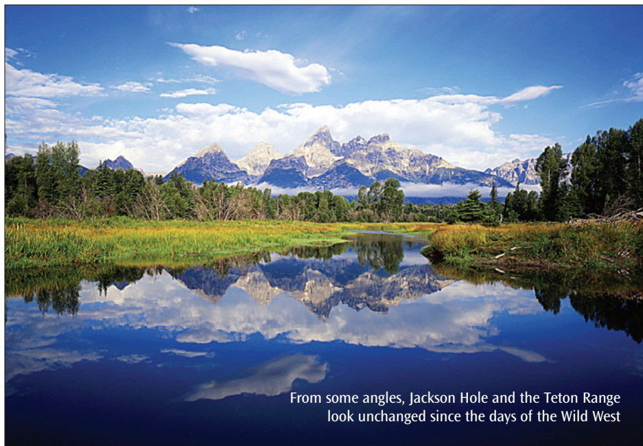
From some angles, Jackson Hole and the Teton Range look unchanged since the days of the Wild West

In early morning, not far along on our guided wildlife drive, the Chevy Suburban emerges from behind a stand of cottonwood trees. A glorious sight rises above the green river valley: a trio of serrated stone peaks, three lofty mountain gods cloaked in snow-white capes.