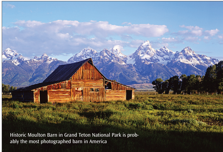
Historic Moulton Barn in Grand Teton National Park is probably the most photographed barn in America

As it has done since 1957, Jackson stages a rootin'-tootin' shootout on the square six evenings a week. After all, Wild West outlaws regularly hid out in Jackson Hole; even Jesse James rode through. I stood on the square with a crowd of rubberneckers, watching blank-cartridge gunfire erupt between the "marshal" and a gang of badmen with squinty eyes and bandan-