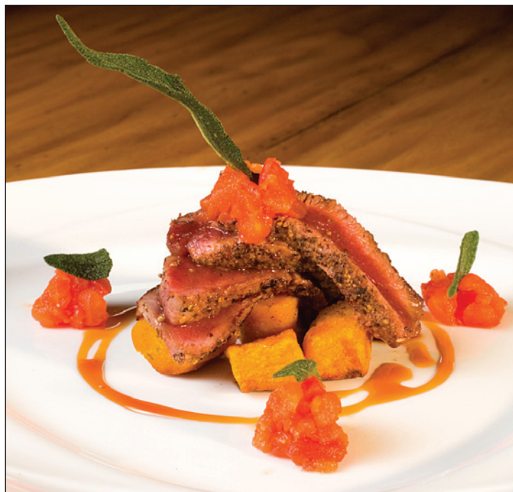
High-elevation cuisine: juniper-and-cracked-pepper-crusted venison reflects the local organic fare at the Rusty Parrot Lodge's Wild Sage restaurant

In town, Snake River Brewing (265 S. Millward) serves award-winning microbrews, pizzas, and meals; at night the lively bar fills with locals.