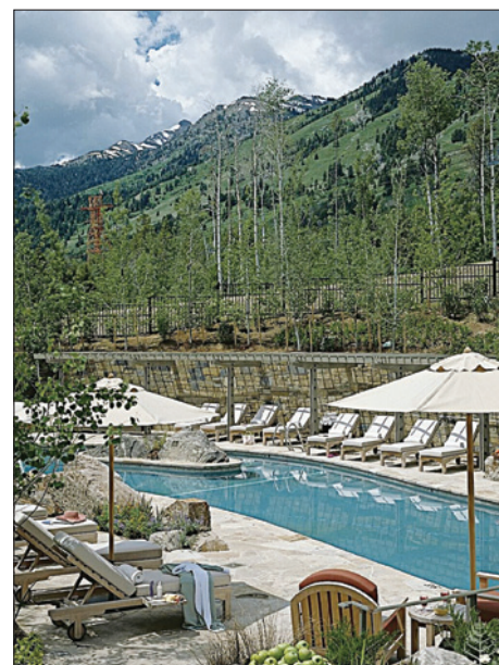
Four Seasons' pool offers summer guests scented face cloths and winter guests heated towels and hot chocolate

All over Jackson, I saw contemporary life bump into the Old West. Atop the red stagecoach that takes tourists around the square, a cowboy and cowgirl sat at the reins. She wore