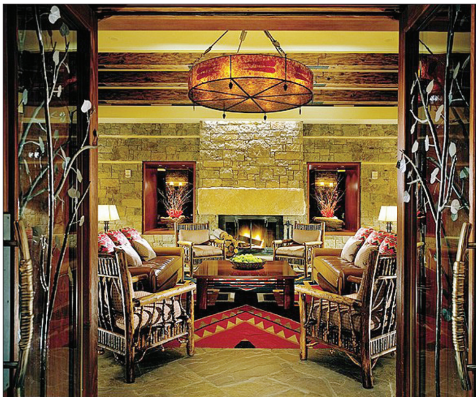
Four Seasons style: natural stone and wood meet design sophistication, creating a modern take on the classic western lodge

amenities such as 400-thread-count Italian linens (I lost count at 281), down comforters, and flat-screen TVs. Breakfast is served by a fireplace in the four-diamond Wild Sage restaurant, featuring dishes such as crème brûlée French toast. For dinner, the exhibition kitchen prepares local game, meats, and seafood. At Body Sage, Jackson's original spa, sports massages feature oil infused with local Arnica leaves, said to ease muscle pain.